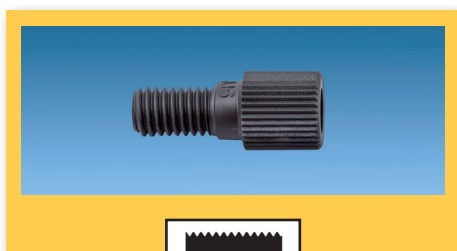
K.P207 1/16" Tubing K.P307 1/8" Tubing