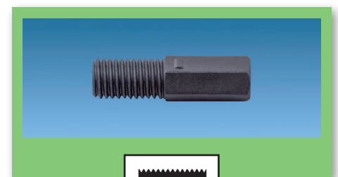
JR-55050 1/16" Tubing JR-55051 1/8" Tubing

Fitting for the System/Glass Column 1/4"-28 G